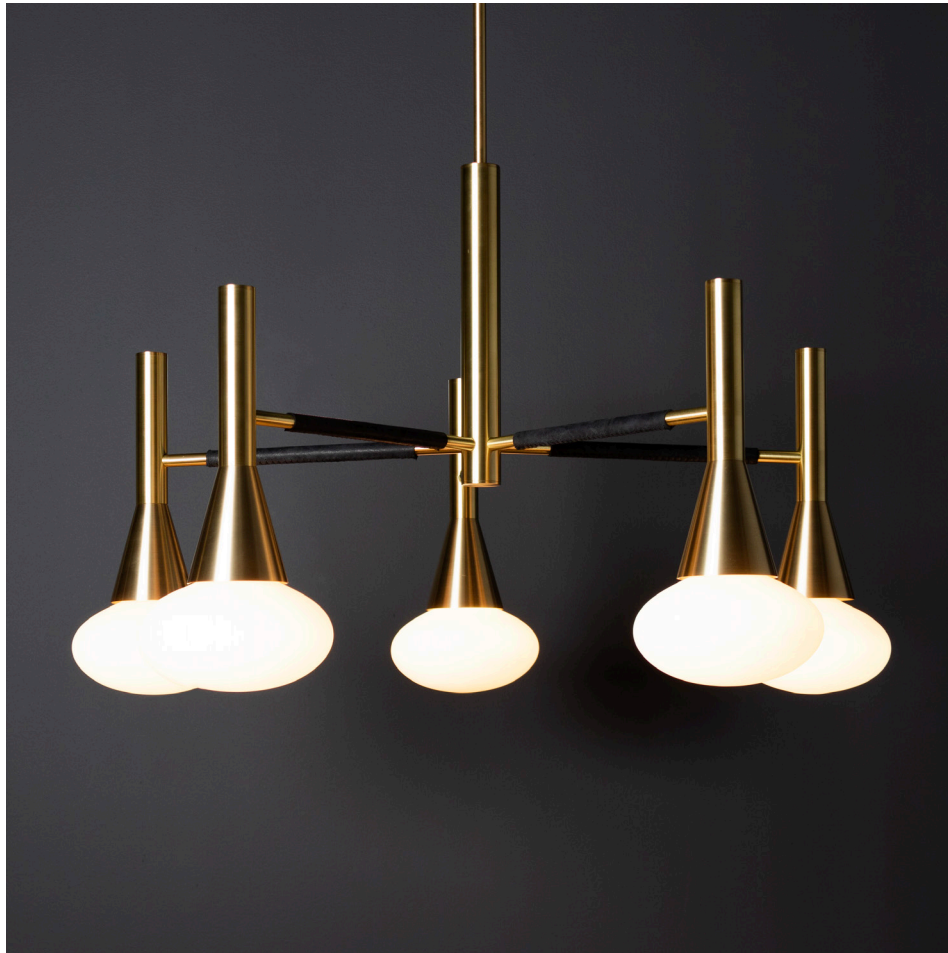
Pictured: Natural Brass, Black Leather